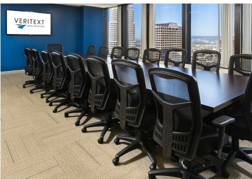
Deposition Suite | Los Angeles

Consistent and reliable deposition solutions across the country or around the world