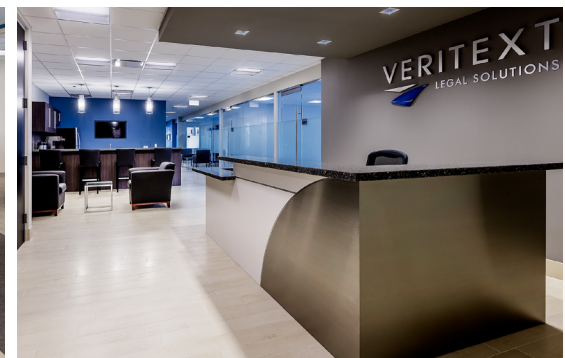
Reception Foyer | Chicago