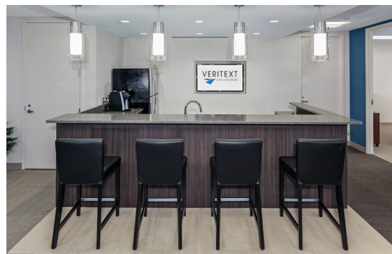
Coffee Bar | Washington, DC